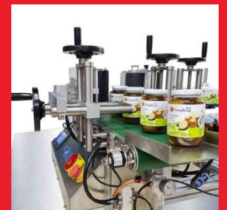
Automated Labeling System