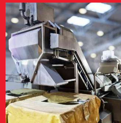
High-Capacity Vegetable Washing Machine (50-ton capacity)