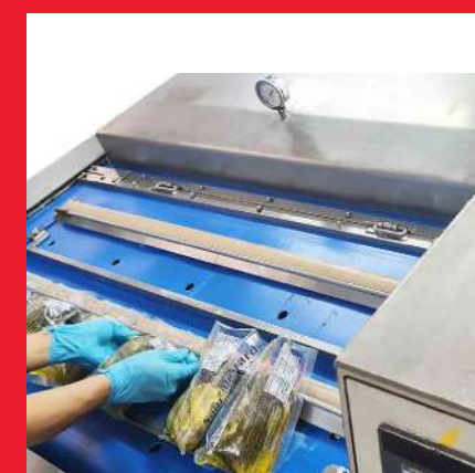
Semi-Automated Vacuum Sealer for Industrial Use