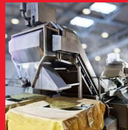
High-Capacity Vegetable Washing Machine (50-ton capacity)